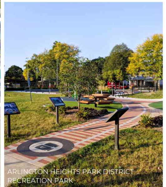
ARLINGTON HEIGHTS PARK DISTRICT RECREATION PARK