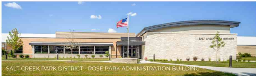
SALT CREEK PARK DISTRICT - ROSE PARK ADMINISTRATION BUILDING

217-523-4554 PH | 217-523-4273 FX | ILparks.org