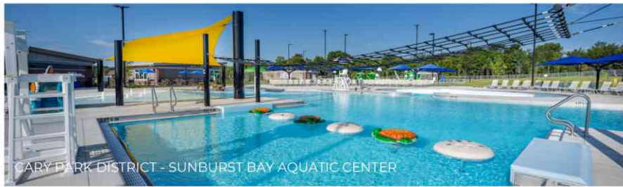
CARY PARK DISTRICT - SUNBURST BAY AQUATIC CENTER