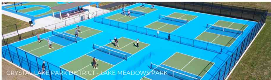
CRYSTAL LAKE PARK DISTRICT - LAKE MEADOWS PARK