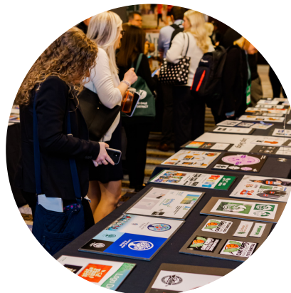
Table Agency Display: Orland Park Recreation Department