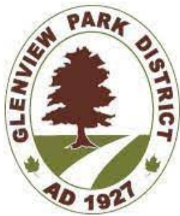
Champions for Change Award Glenview Park District